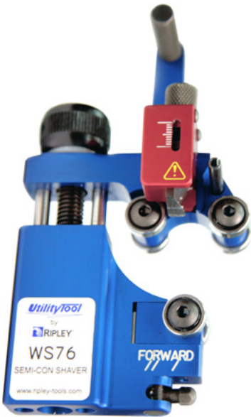
Replacement blade 43577

Cable stripping tool to remove the outer jacket and insulation on cable 12.7mm to 63.5mm. Quickly and easily adjusts to the cable size with spring loaded trigger action jaw. Compact design for tighter work space requirements.