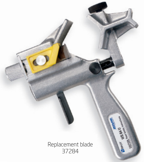
Replacement blade 37284