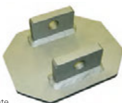
Weld On Mounting Plate