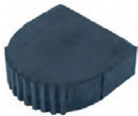
Moulded end caps