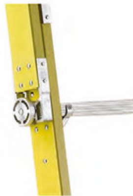
Hand operated taper-lock secures mating sections